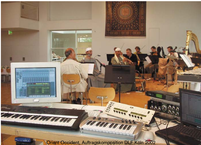
Orient Occident, Auftragskomposition DLF Köln 2002