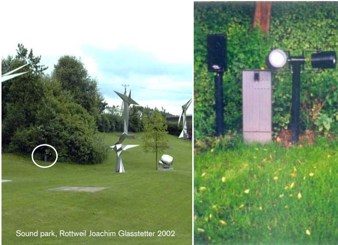
Sound park, Rottweil Joachim Glasstetter 2002